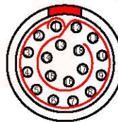
Welded surface (焊锡面)