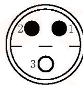
Welded surface (焊接面)