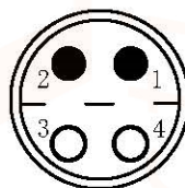
Welded surface (焊接面)